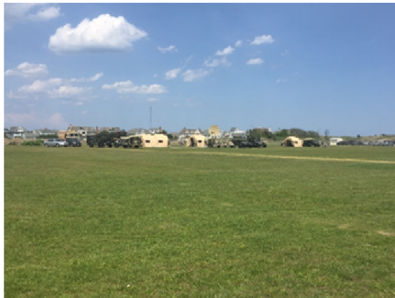
WIN-T Training B Co / C Co Seagirt, NJ