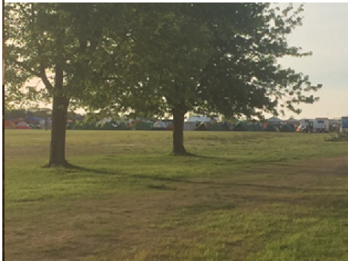
NJ Boy scouts Camporee Co-located near 01 AO Seagirt, NJ