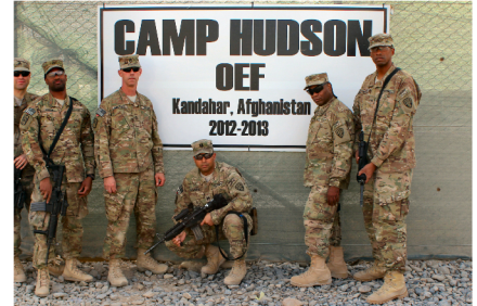
101 ESB Enterprise Operations Team

Remember July 2012 Afghanistan 5 Years Ago WOW How time Flies.