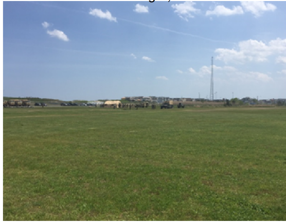
WIN-T Training A Co / C Co Seagirt, NJ

WIN-T Crew Training: 101ST ESB conducted company level WIN-T exercise at Sea Girt, New Jersey. Simultaneously, Unit representatives conducted a Signal Training Exercise utilizing TROPO (Beyond line of Sight) at Camp Smith, NJ. HHC, Alpha, and Bravo successfully deployed newly fielded SNAP (SIPR NIPR Access Point) satellite terminals.