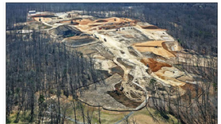
Aerial view of the future museum grounds on Fort Belvoir, Va. Aerial view of grounds for the future US Army Museum to be built at Fort Belvoir, VA

To Promote the Esprit de Corps and Fraternity of the Signal Corps